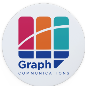
View from printed side

Your artwork is flipped and printed onto the non-adhesive side of the material. It will be readable from the adhesive side but visible from both sides. Ideal for shop windows.