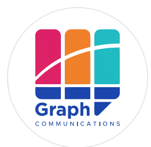
View from adhesive side