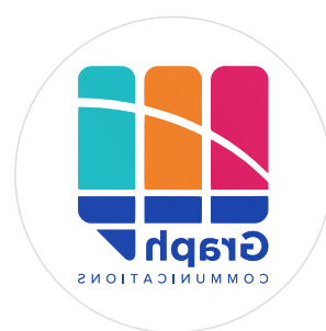
View from printed side