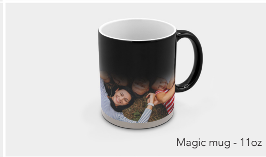
Magic mug - 11oz