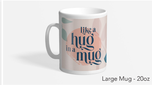
Large Mug - 20oz