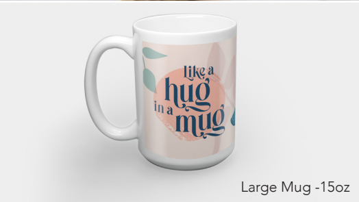
Large Mug - 15oz