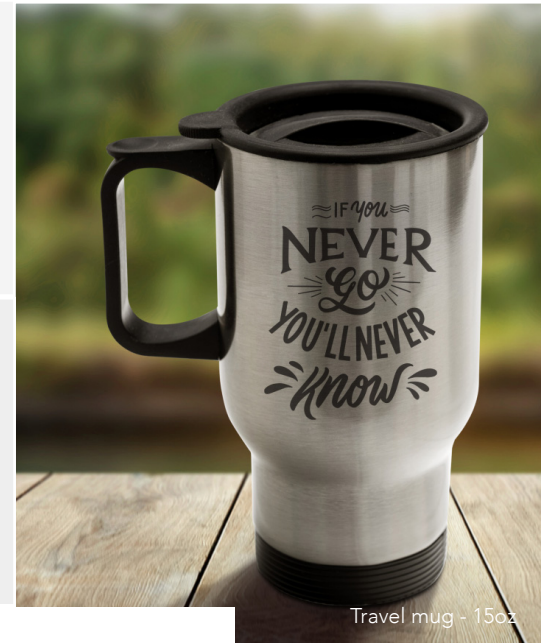
Travel mug - 15oz