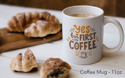
Coffee Mug - 11oz