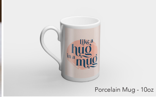
Porcelain Mug - 10oz