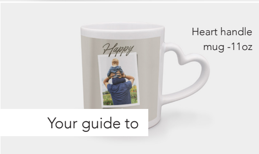
Heart handle mug - 11oz