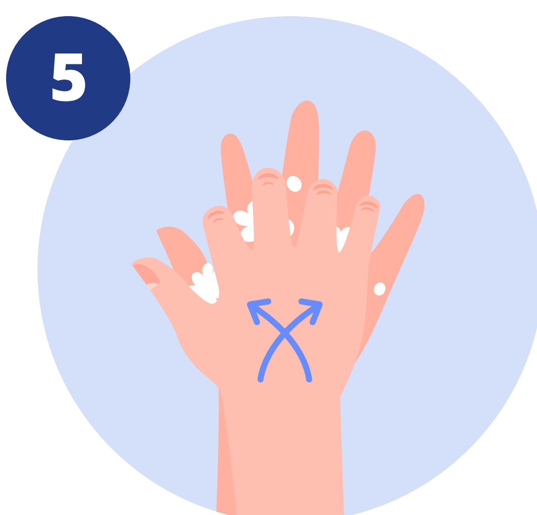
Scrub between fingers