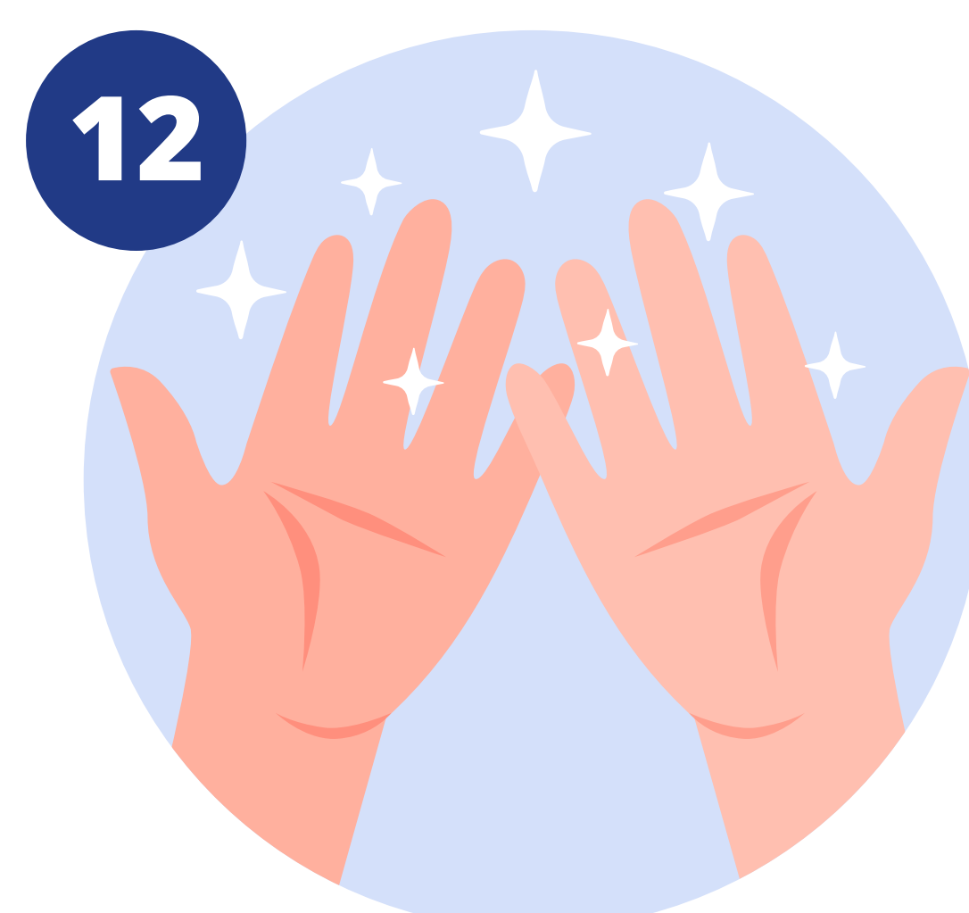
Your hands are clean