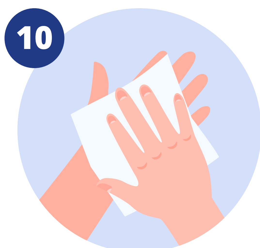
Dry with paper towel