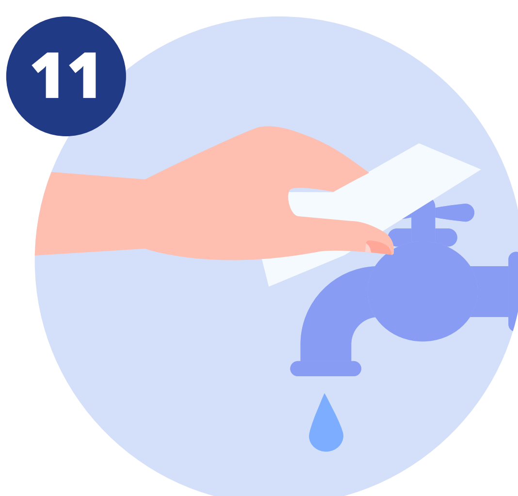
Turn off faucet