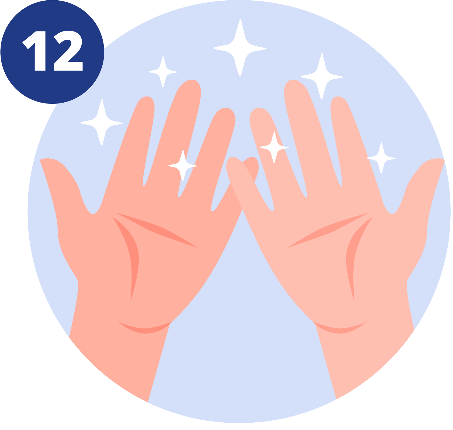
Your hands are clean