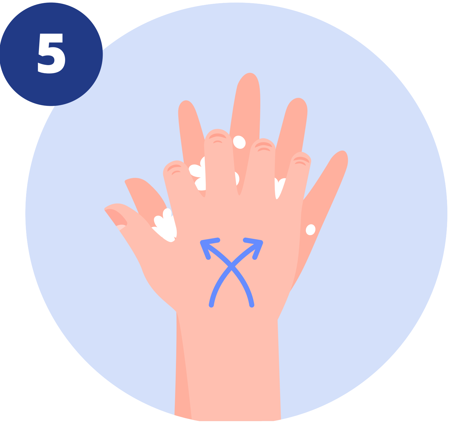
Scrub between fingers