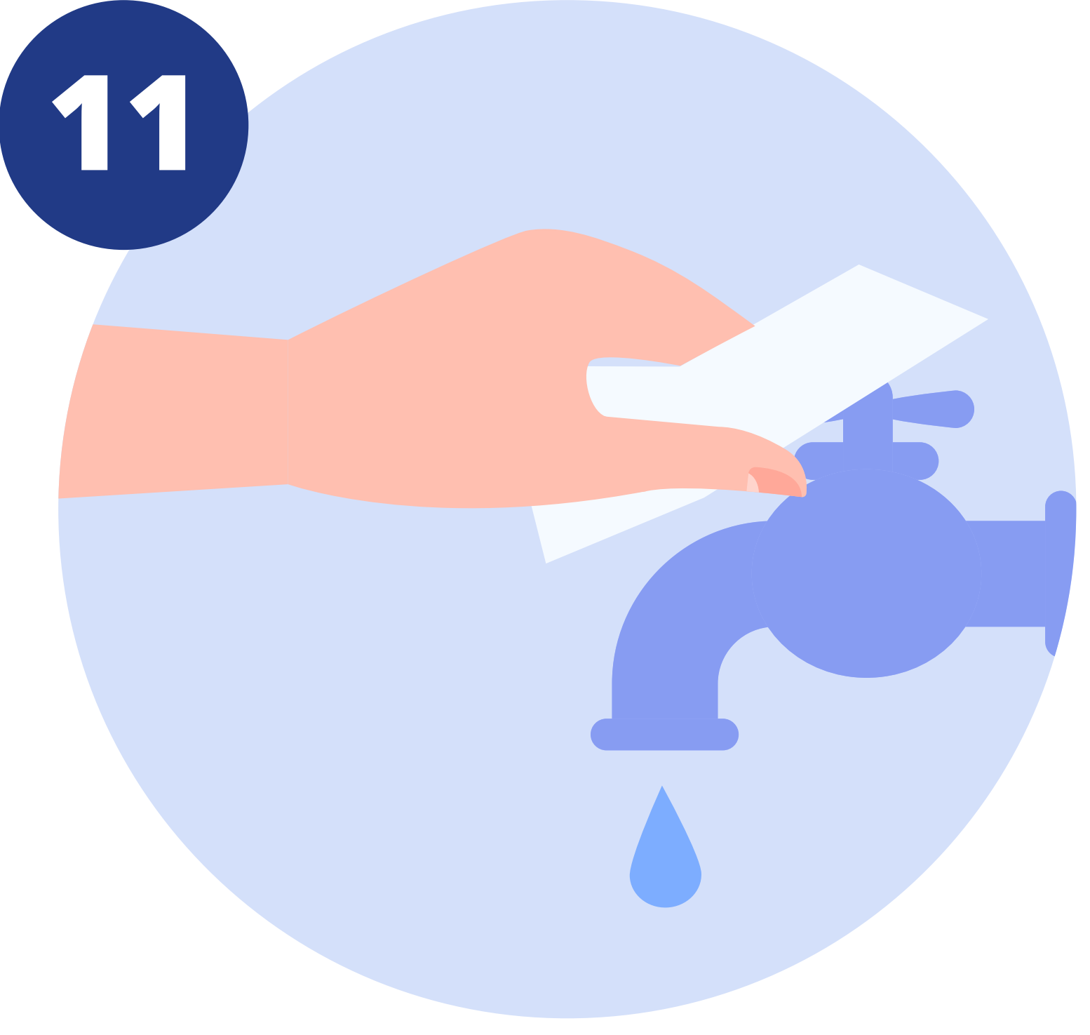
Turn off faucet