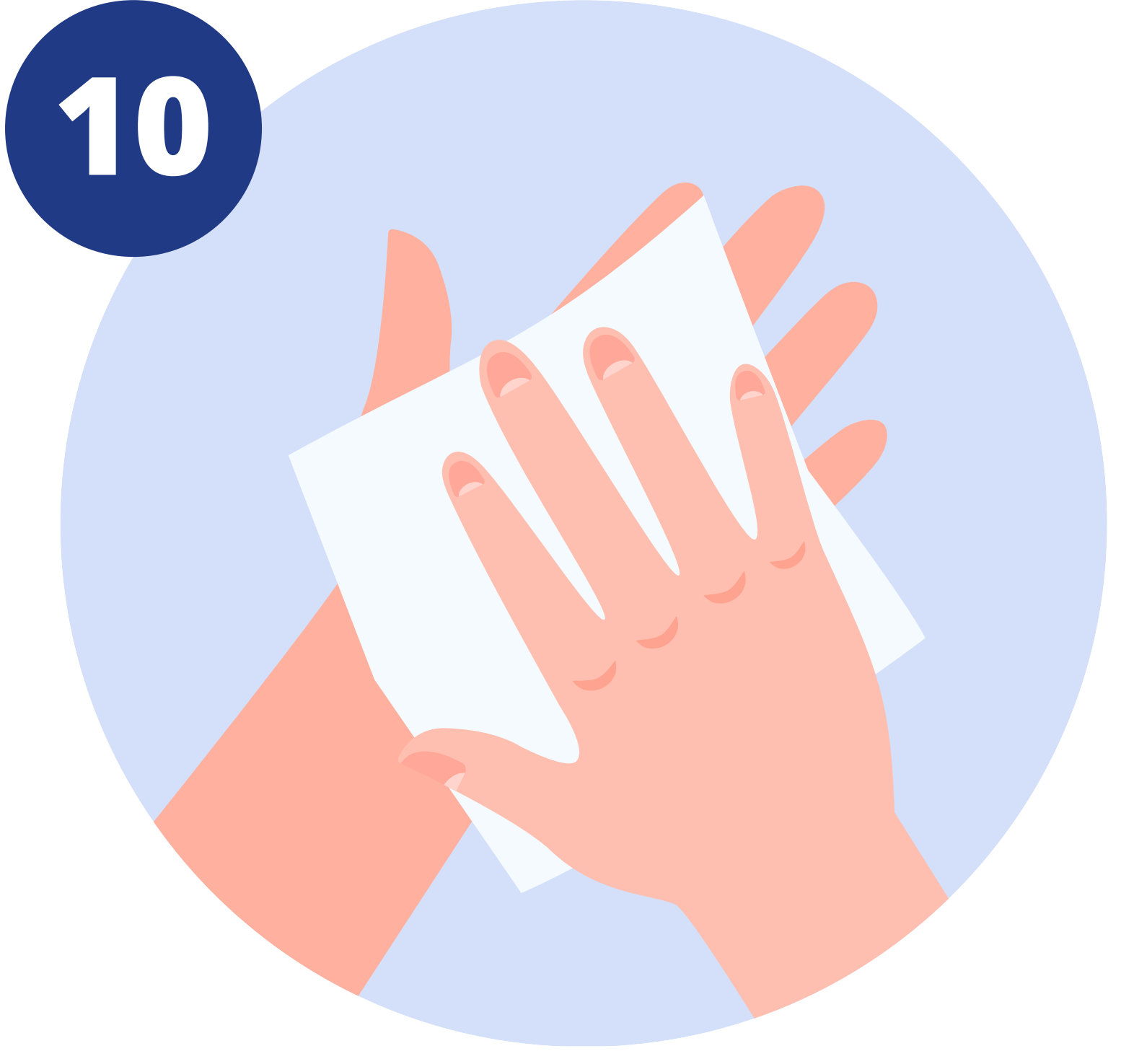
Dry with paper towel